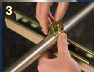
Hex head screw fits through keyhole.