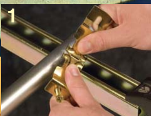
One-piece design snaps apart.