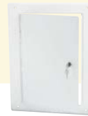
HINGED COVER FOR FOXBOX™