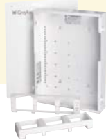
FOXBOX™ HOME ENCLOSURE