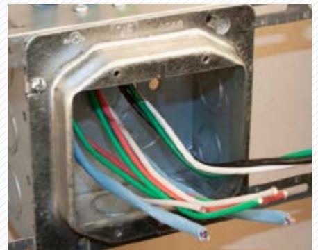
Accepts larger cables, including MC-PCS luminaire cables for smart building applications