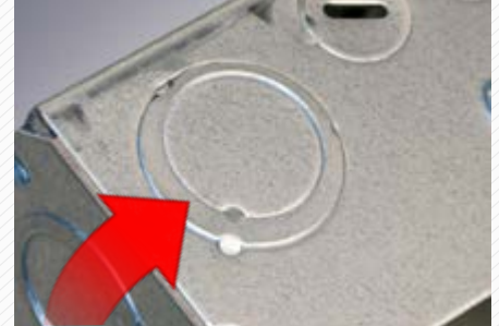
Eccentric knockout on the same side of the box as the STAB-iT connector