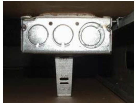
New, Heavy Duty UBS (987), accommodates 2.5" - 6" stud depths, featured on models ending in "HF"