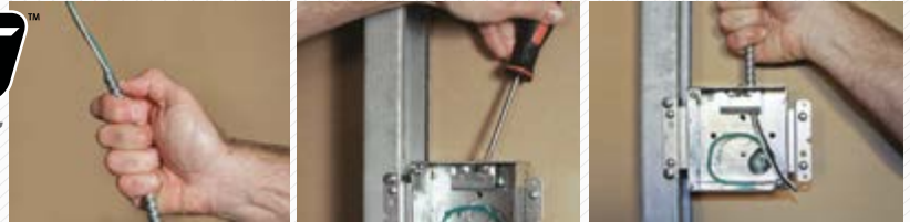
1. Prepare Cable 2. Remove Priout 3. Insert Cable...Done!