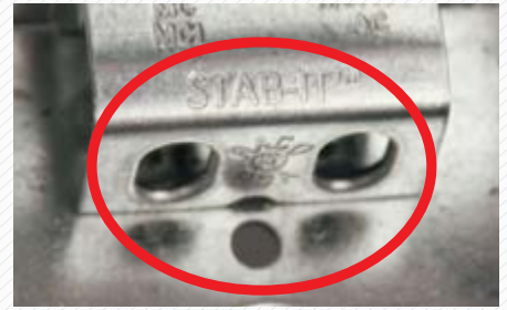
Rollled steel edges eliminate the need for plastic bushings, except for AC Cable