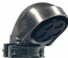
Entrance Heads – Clamp Type For Rigid/IMC or EMT – Aluminum