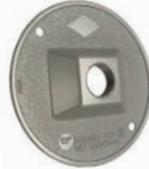
5193-0 TO 5193-7