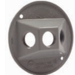
5197-0 TO 5197-7