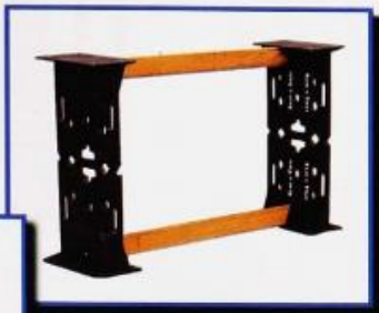
Work bench frame