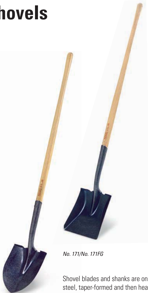
No. 170/No. 170FG