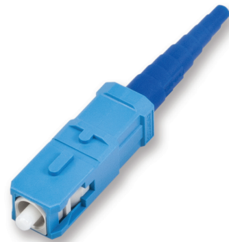
Part Number: 95-200-41

The lightweight, hand-held installation tool and high-performance precision cleaver virtually eliminate human variability during installation, ensuring terminations are right the first time, every time. This kit was designed with consideration for network installers, from the cleaver, with its intuitive, hand-held precision design and dual-clamp precision hold, to the installation tool, with its immediate go/no-go feedback signal indicating proper mating of the field fiber to the fiber stub. Installation is as easy as strip, clean, cleave, cam and crimp, with exceptional optical performance assured. Every UniCam® connector is assured to meet the published specification at the time of installation or Corning will replace it.