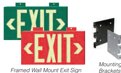
Framed Wall Mount Exit Sign