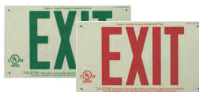
Frameless BradyGlo™ Exit Signs