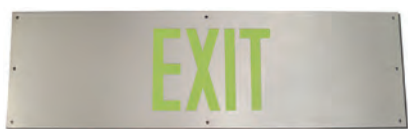
BradyGlo™ Kick Plate Exit Sign