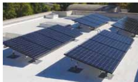
Installation with tilt hardware kit