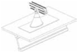
Standoff with flashing