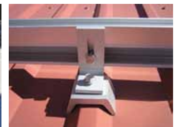
Corrugated Roof Straddle Block