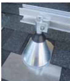
Standoff with flashing