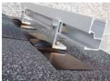
L-foot with flashing