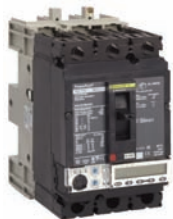
H-Frame and J-Frame Plug-in Mounting