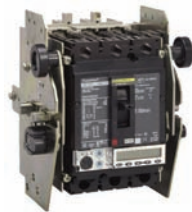
H-Frame and J-Frame Drawout Mounting