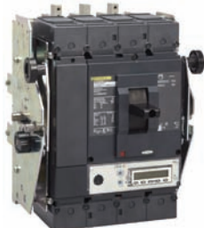
L-Frame Drawout Mounting