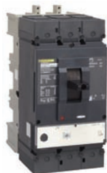
L-Frame Plug-In Mounting