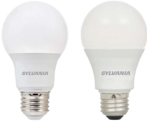
450lm and 800lm