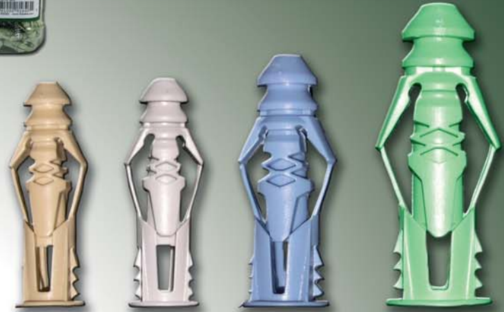
SIZE: #6 #8 #10 #12