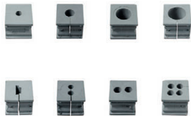
Cable grommets for ASI cables