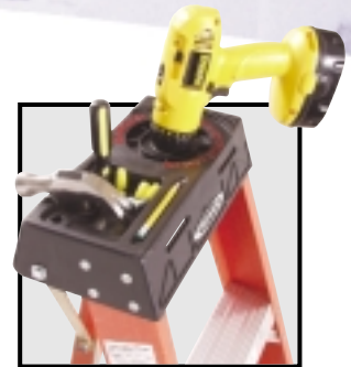
Tool-Tra-Top® with drill holster, tools and paint can holder

Double riveted comfortable Traction-Tred® steps for slip-resistance and durability