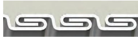
Interlocked Design 1-1/2" through 4" with no bonding wire