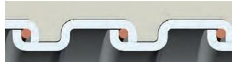
Square-Locked Design with integral bonding wire 3/8" through 1-1/4"